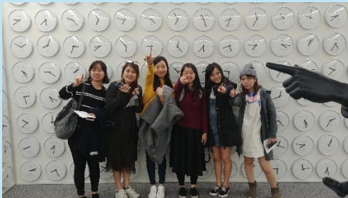
Korean Artists from Venice Biennale Arco Center