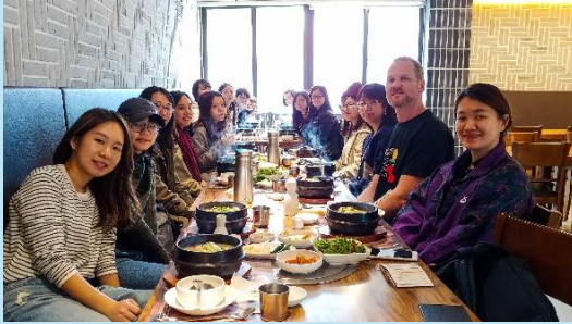
Traditional Ginseng Soup Busan