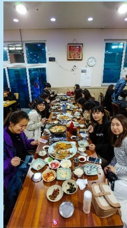
Seafood and live Octopus tasting, Busan