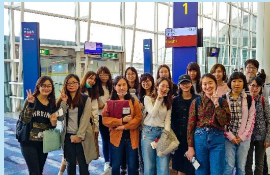
Departure for Seoul