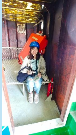
Art Village, Busan