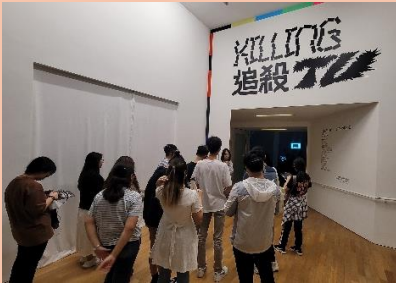
"Killing TV" Exhibition

Experiential learning & field trips with CAC1002, ART2199, & VAC6003: 2019-2023