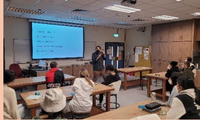
Guest Speaker from PolyU