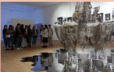
Tai Kwun Contemporary Pavilion