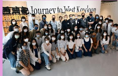
Staff & Students at M+