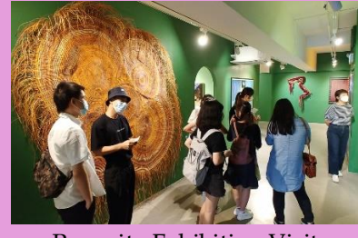
Para-site Exhibition Visit