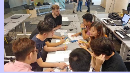
BANQ: Sound Station