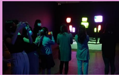
Asia Society Visit