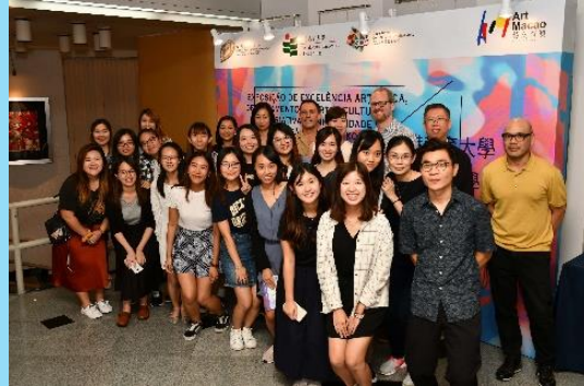
Group Photo: Staff & Students