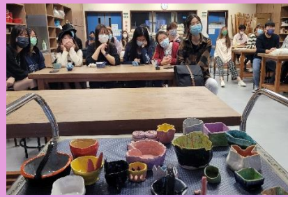
Glazed ceramics after firing