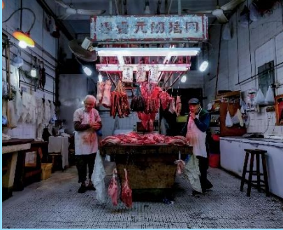
Poon Chak Yam "Sleepless City" (2)