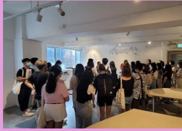
Second group visit to LG