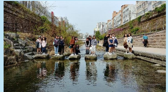
Seoul river revitalization project