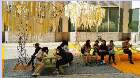
McCord Museum of Art