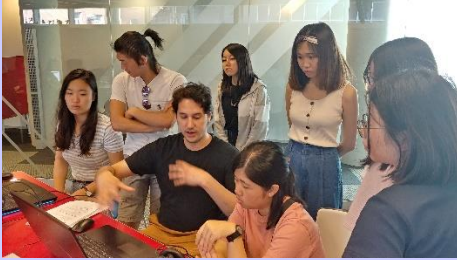
BANQ: Arduino Station