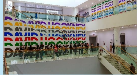
Seoul Art Museum: David Hockney