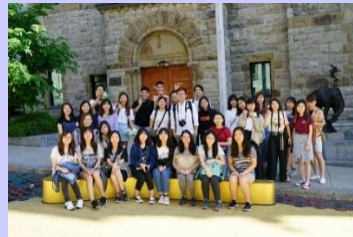
MTL Museum of Art