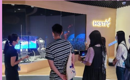
Examining Victor Wong's AI artwork