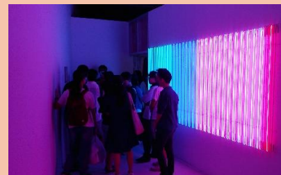
Neon Light Exhibit