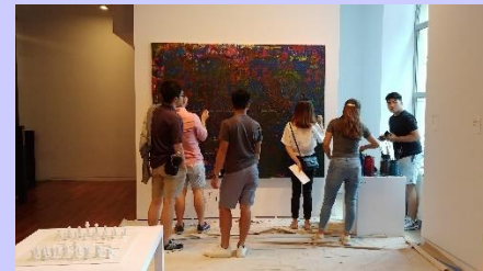
Gallery Visit Old Port