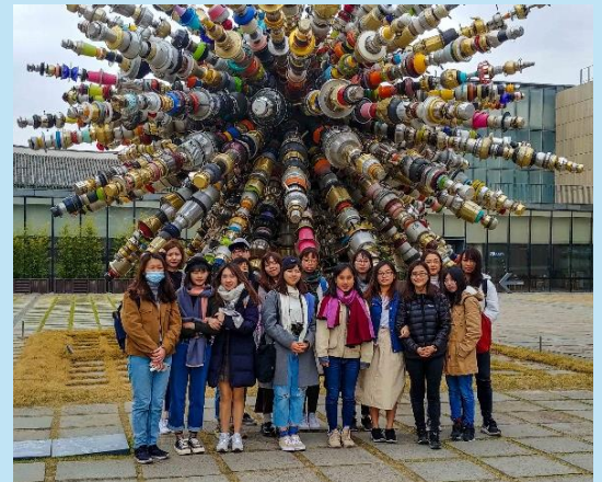
Installation: National Art Museum