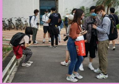
Field shooting practice in Tai Po