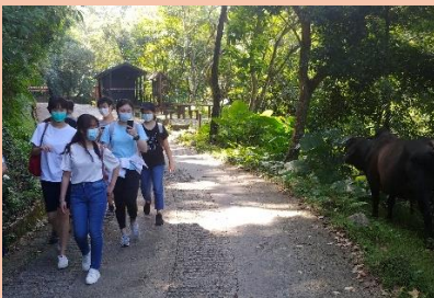
Encounters with wildlife