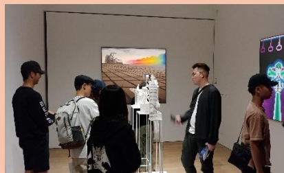
Cyber Punk Artworks