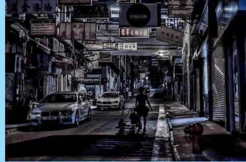
Poon Chak Yam "Sleepless City" (3)