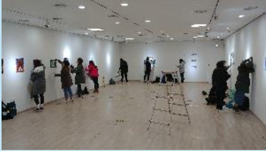
Exhibition Installation KHU