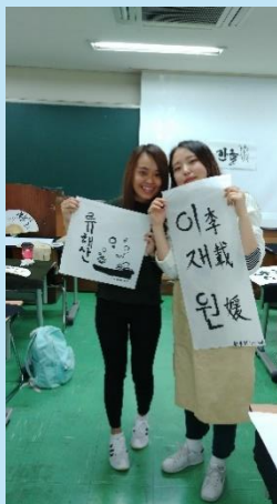
Korean Ink Class '18