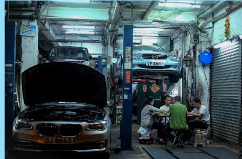
Poon Chak Yam "Sleepless City" (1)