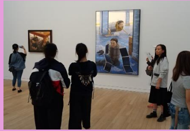
Examining Lee Bul's artwork