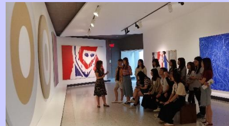
MTL Museum of Fine Arts