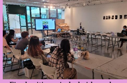
Final critique in hybrid mode