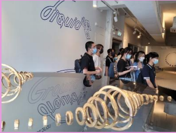
Liquid Ground Exhibit