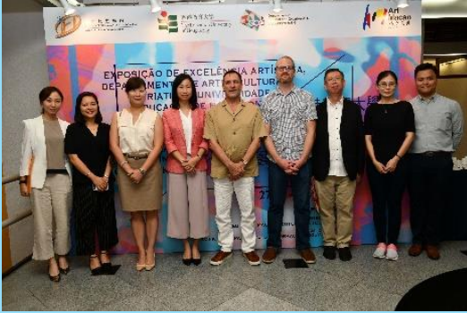
Group Photo: Staff