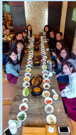
Meal with KHU