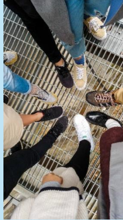
Culture Tank Visit