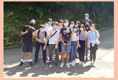
Group at park entrance