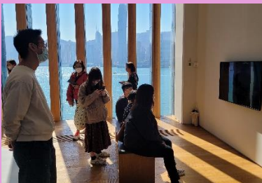
Visiting M+ Exhibits (hybrid)