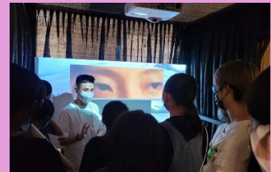
Second group visit at Para-site