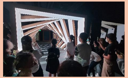
HKSTP Exhibition Visit