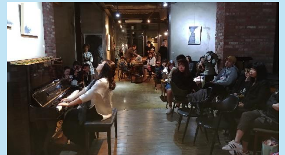
Artist Improv performance Gallery Merge, Busan