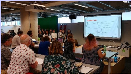
Pitches: Panel of Expert Judges