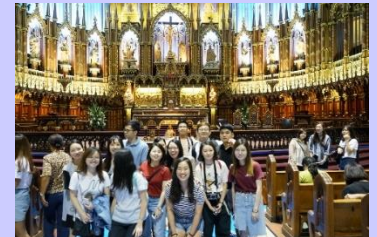
Notre Dame Basilica