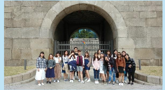
Dong-dae Mun East Gate Seoul