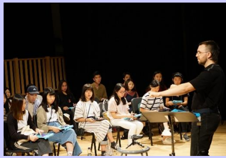
UQAM mobile pedagogies