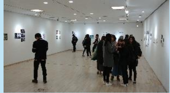
Exhibition Opening KHU