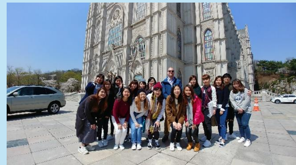
KHU Cathedral '18