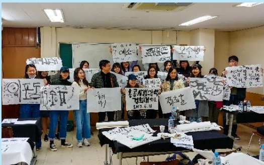
Korean Ink writing Class '19