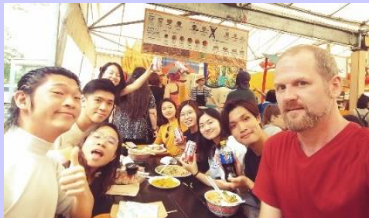
Atwater Market Eateries