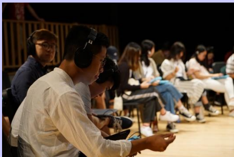
UQAM mobile pedagogies