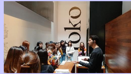
Phi Center: Yoko Ono Exhibit