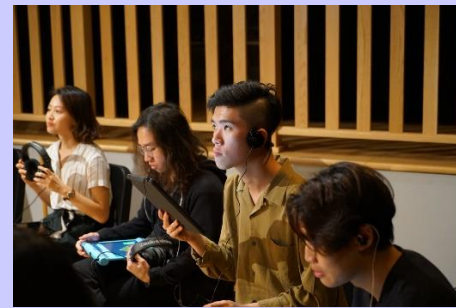
UQAM mobile pedagogies