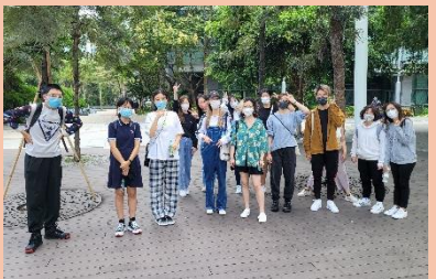
Exploring Science Park