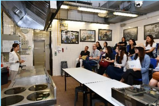
Campus Tour: Macau Tourism Inst.