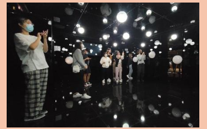
Immersive sound room